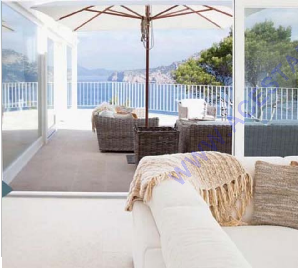
→ Patio and balcony